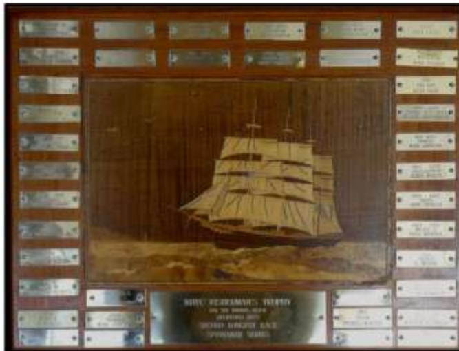
Fishermans Perpetual Trophy PHRF A