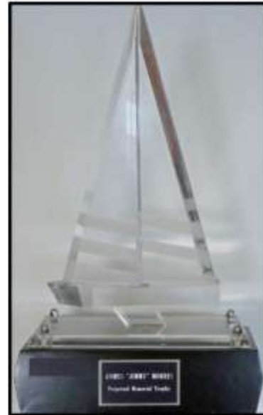
Jimmie Morris Perpetual Trophy PHRF B